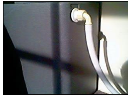
Flexible overflow (fig. 2)