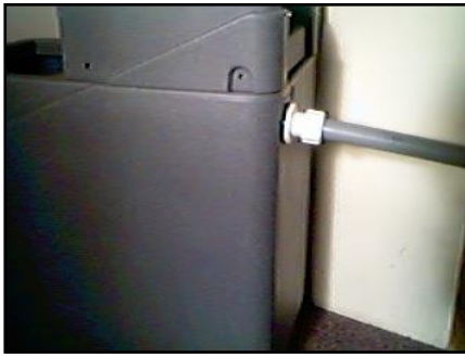
Rigid Overflow (fig. 1)